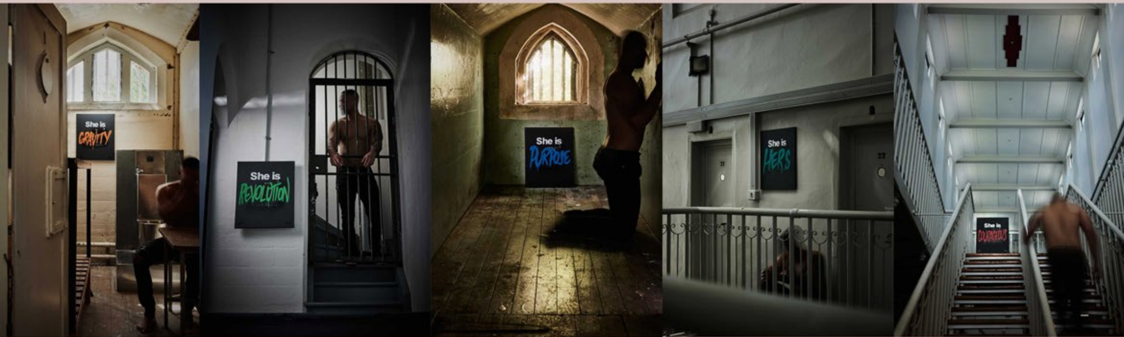
The main staircase

Photographer Felix Wu photographed each of the 100 pieces individually, focusing on the message of the art and the movement of the prisoner in this confined space.